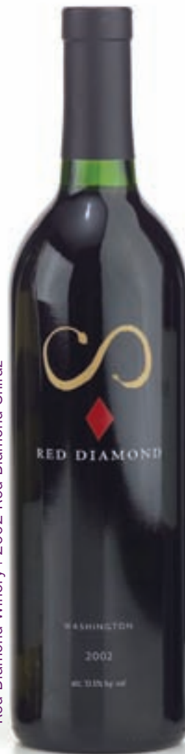
Red Diamond Winery | 2002 Red Diamond Shiraz