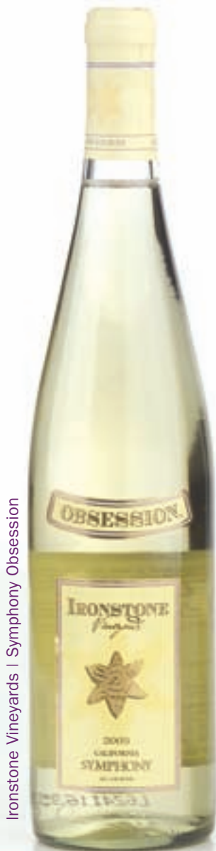
Ironstone Vineyards | Symphony Obsession

The readers of ¡Sabroso! , who follow the “Wine Connoisseur” column, know that I seek out what I feel are the best buys in wine. I always promote the fact that price is not indicative of quality . There are many wines produced that are exceptional but do not receive the kudos or reviews that they deserve. That’s where this column comes in. In each column I review and suggest wines for which consensus puts them into the category of affordable and above average quality. Part of the criteria will include local availability of the reviewed wines. Nothing bothers me more than reviewing a wine that can only be found in Timbuktu. Keeping in mind that everyone’s taste is different, I will try to be as mainstream as possible by considering the cuisine of the southwest and the dining habits we all live by.