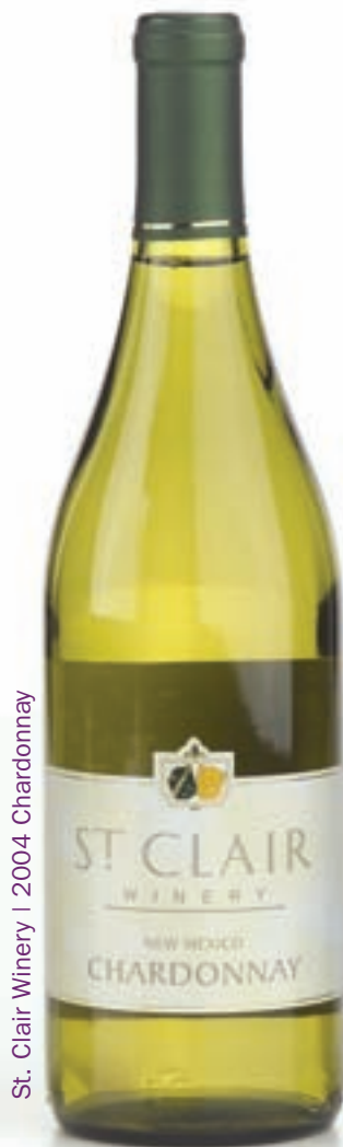
St. Clair Winery | 2004 Chardonnay